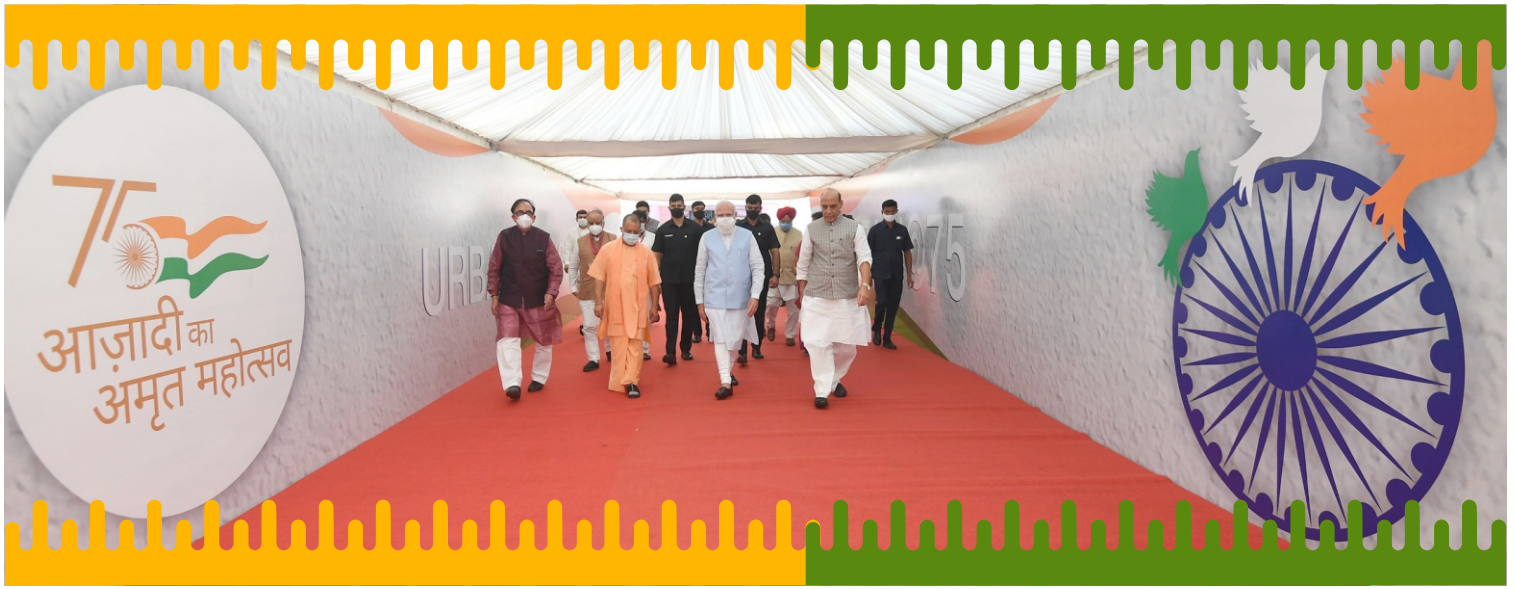
Inaugural session of 'Azadi@75 - New Urban India' Conference-cum-Expo on 5 th October 2021 at Lucknow, Uttar Pradesh