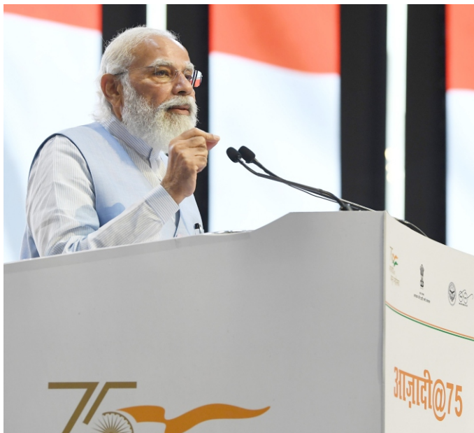
Hon'ble Prime Minister's address at inauguration of 'Azadi@75 - New Urban India' event

On 5 th October 2021, Hon'ble Prime Minister Shri Narendra Modi inaugurated 'Azadi@75 - New Urban India: Transforming Urban Landscape' Conference-cum-Expo in Lucknow. The grand event was organised as part of 'Azadi ka Amrit Mahotsav'. Union Ministers Shri Rajnath Singh, Shri Hardeep S Puri, Shri Mahendra Nath Pandey, Shri Kaushal Kishore were present. Hon'ble Governor of Uttar Pradesh Smt Anandiben Patel and Hon'ble Chief Minister of Uttar Pradesh Shri Yogi Adityanath also graced the occasion.