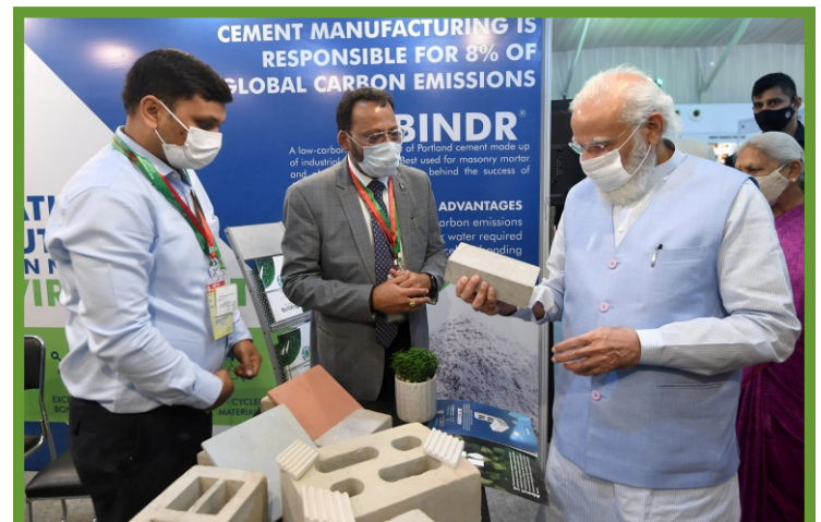
Hon'ble Prime Minister visits to the exhibition area at the 'Azadi@75 - New Urban India' expo

2. Under Global Housing Technology Challenge-India (GHTC-India), an exhibition on 75 Innovative Construction Technologies, named 'Indian Housing Technology Mela' (IHTM) showcased domestically developed indigenous and innovative construction technologies, materials and processes which could be useful for Beneficiary Led Construction (BLC) houses under Pradhan Mantri Awas Yojana-Urban (PMAY-U) and other low & mid-rise houses.