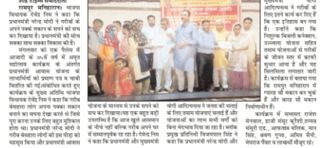
प्रधानमंत्री आवास योजना के लाभार्थियों को सौंपी चाबी की समारोह में शामिल हुए प्रधानमंत्री नरेंद्र मोदी और उपप्रधानमंत्री अमित शहा।