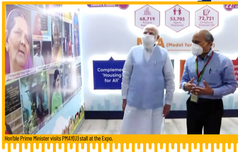
Hon'ble Prime Minister visits PMAY(U) stall at the Expo.

3. An exhibition to showcase performance of Uttar Pradesh under the Flagship Urban Missions and future projections as UP@75 themed 'Transforming Urban Landscape in Uttar Pradesh' was at display.