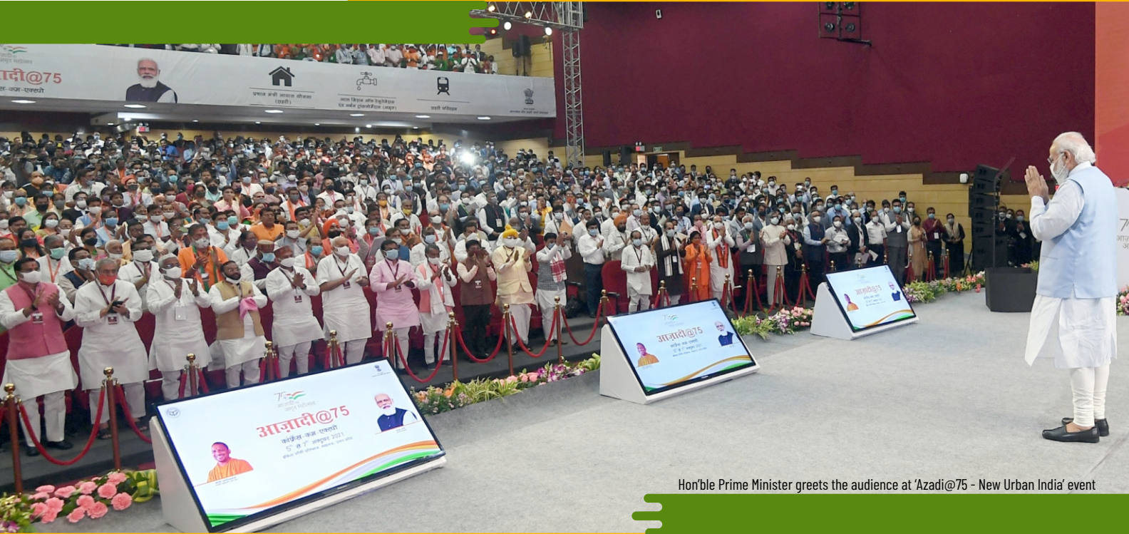
Hon'ble Prime Minister greets the audience at 'Azadi@75 - New Urban India' event